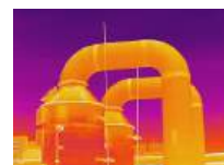
Oil and Petrochemical