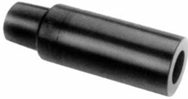
Figure 6. Cable adapter

Molded cable adapter is available in sizes to fit cables from .610" to 1.970" in diameter (15.5 to 50.0 mm). It is molded of high quality peroxide cured insulation and semiconductive rubber to provide stress relief for terminated cable.