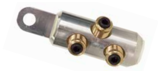
Figure 5. Shear bolt connector.

Bolted cable lug is fitted with stepless bolts, which shear off when optimum contact force has been reached. Provides electrical continuity for copper and aluminum conductors while eliminating need for dies and compression tools. Available in unthreaded aluminum for both BOL-T and Eaton's Cooper Power series BT-TAP connector applications only. See Table 5 for proper application.