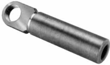
Figure 4. Compression connector.

Compression connectors are available in all aluminum or friction welded coppertop designs, aluminum with unthreaded holes and coppertop with either threaded or unthreaded holes. See Tables 3 and 4 for proper application. All connectors have aluminum crimp barrels and are designed for use with either aluminum or copper conductors.