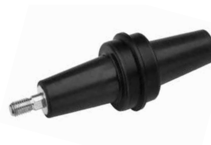
Figure 3. Connecting plug (EPDM rubber) shown with stud.

The versatile design can be used for connecting two or more 600 A deadbreak connectors or, with a bushing extender, to ease cable training by increasing the distance between an apparatus front plate and 600 A connector.