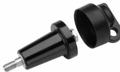
Figure 2. Insulating plug with EPDM rubber cap.

Semiconducting EPDM rubber cap fits over the test point for a waterproof seal and deadfront shielding.