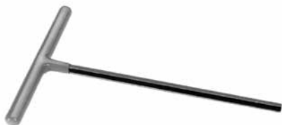
Figure 11. T-Wrench.

The T-wrench is used to install an LRTP into a connector. It is a T-handled, 5/16" hex wrench.