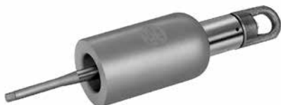
Figure 10. Operating and test/torque tool.

This tool combines the benefits of the O & T and torque tools into one convenient clampstick-operable tool. Used with LRTP-equipped connectors, the EPDM cap latches to the 200 A interface for clampstick operation. The integral torque limiter allows the operator to properly torque connectors without changing tools.